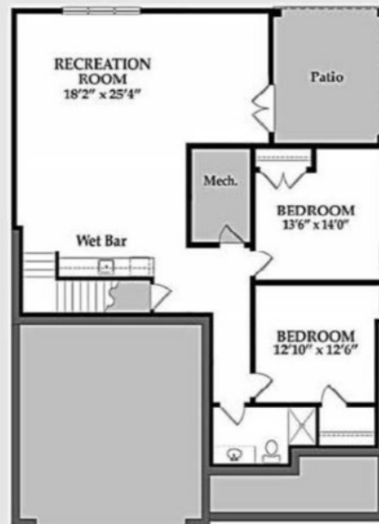
OPTIONAL BASEMENT FINISH